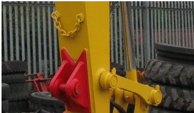
Figure 1 Example of load lifting point