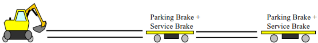
Fig 1 Towing vehicle and trailers compliant with service and parking brake couplings connected

2.2.2 Trailers should be attached as example shown in Figure 1.